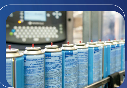
Arnest MetallPack, LLC

Construction of a plant for the production of tinplate cans and tin containers - beverage can containers