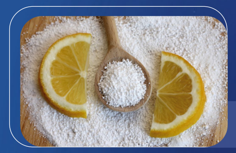
Organic Acids, LLC Construction of a 60MTPY citric acid industrial complex