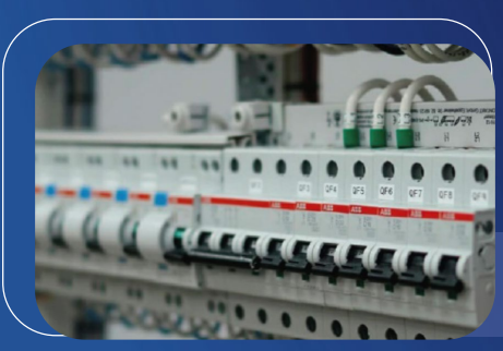
ABB-energo Elektroseti, LLC

Construction of a plant for the production of electrically-powered equipment