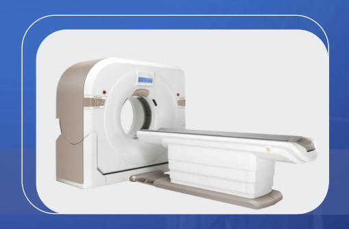
Sonder, LLC Construction of a medical equipment plant