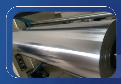
ML Group, LLC

Construction of a plant for manufacturing alufoil-based packaging materials